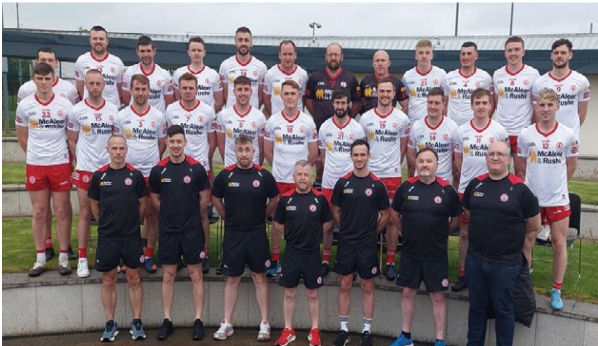
Tír Eoghain – 2022 Nickey Rackard Cup and NHL Div 3A champions – players and management