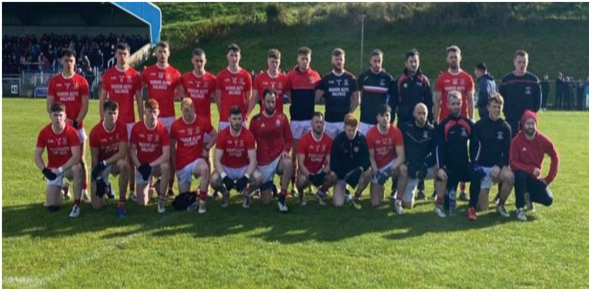
Tyrone ACL Division 1 Champions – Trillick St Macartan's