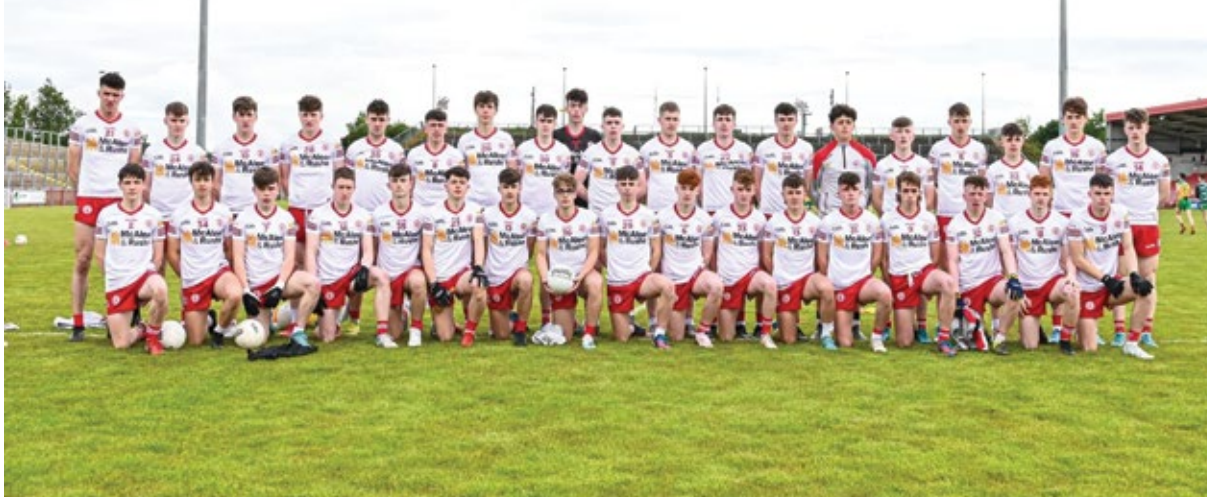
Ulster Minor Football Champions 2022