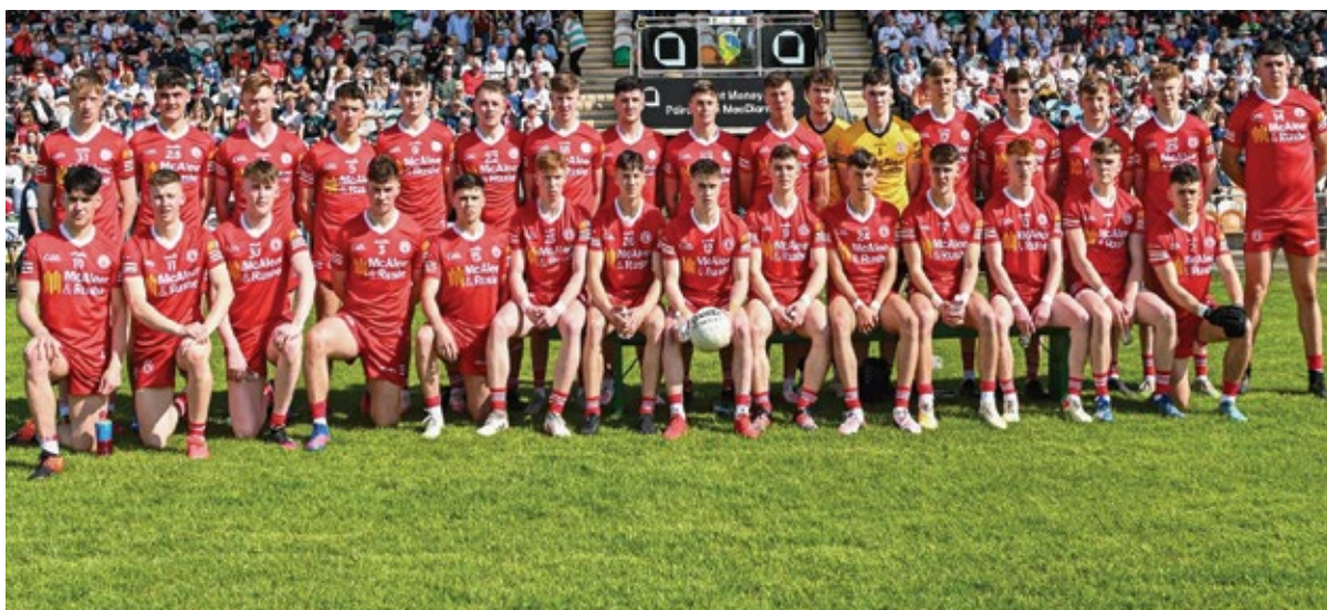
Ulster & All-Ireland U20 Football Champions 2022

And the complete training panel for 2022: