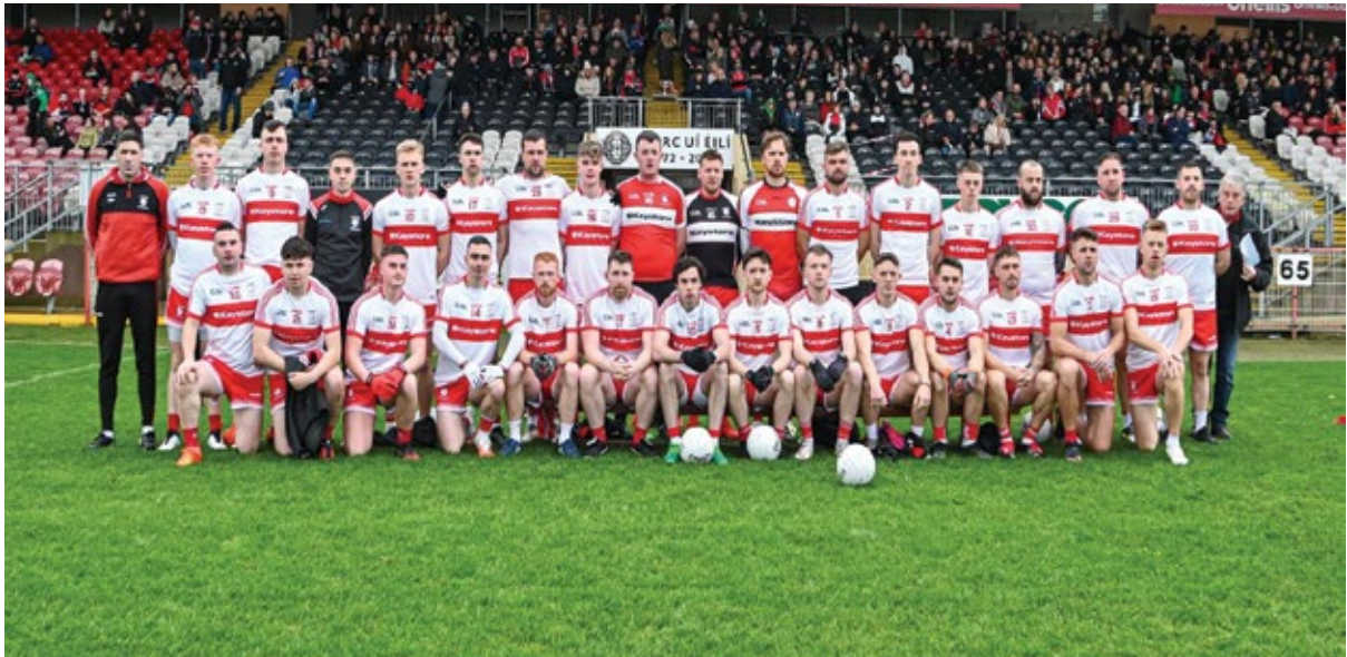
Tyrone & Ulster Junior Football Champions 2022 – Stewartstown Harps