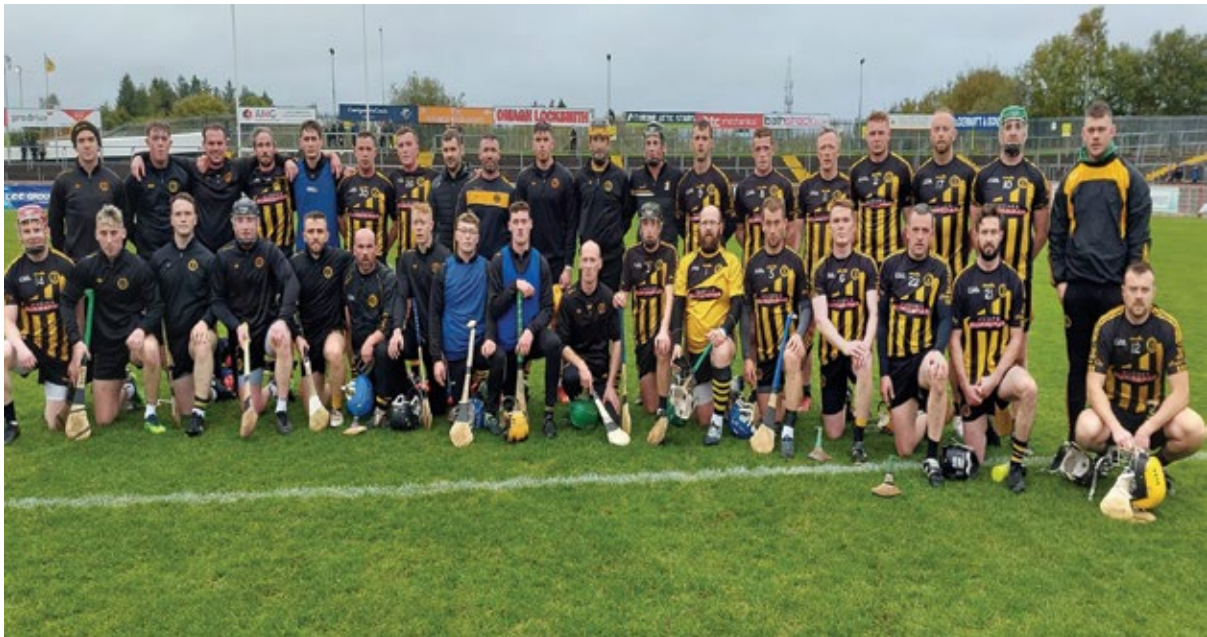
Tyrone Senior Hurling Champions 2022 – Carrickmore Éire Óg

Galbally qualified for its second Ulster final in three years against Corduff (Monaghan) following victories over Glenullin and Dungloe. Stewartstown swept aside the challenges of Teconnaught and Letterkenny before a tough provincial final encounter with Drumlane (Cavan) saw the Club emerge as Ulster champions in a penalty shoot-out after extra time.