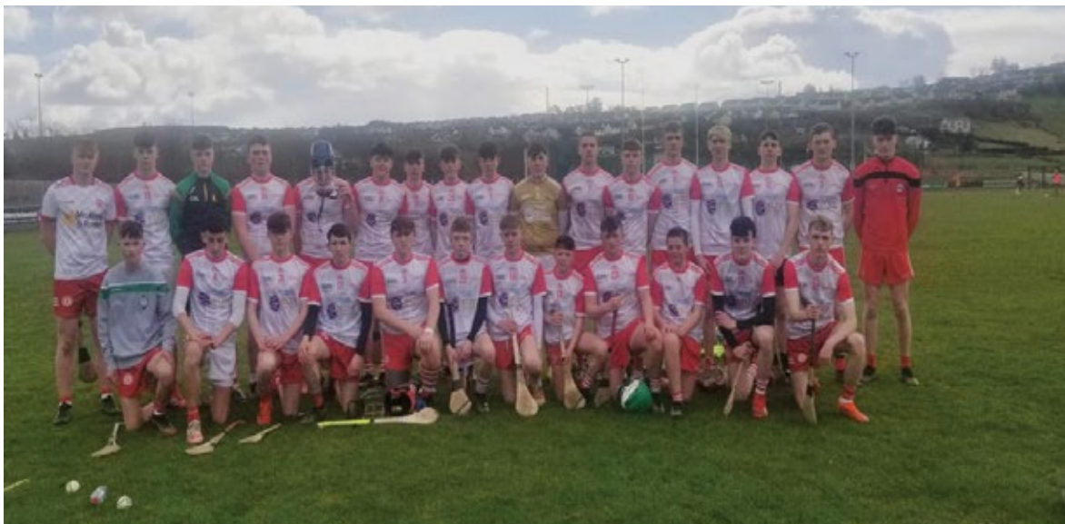
1Tír Eoghain Minor (U17) Hurling Team 2022

Overall this has been a very successful year with large numbers of members trained, an increase in clubs engaging in a positive way and Club Children's Officers providing high levels of support to their clubs. This coupled with low figures for Child Protection Investigations and other breach proceedings indicates that the systems in place are working and protecting our children and families. However, this doesn't mean we can relax and 2023 will no doubt bring a new set of challenges as well as building on the fantastic work that has been achieved in 2022.