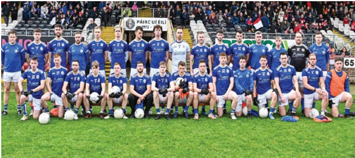
Tyrone Intermediate Football Champions 2022 - Galbally Pearses

stepped up their performance once again and although their lead was cut from four points to one, the Pearse's deservedly won a second IFC title to add to that of 2019.