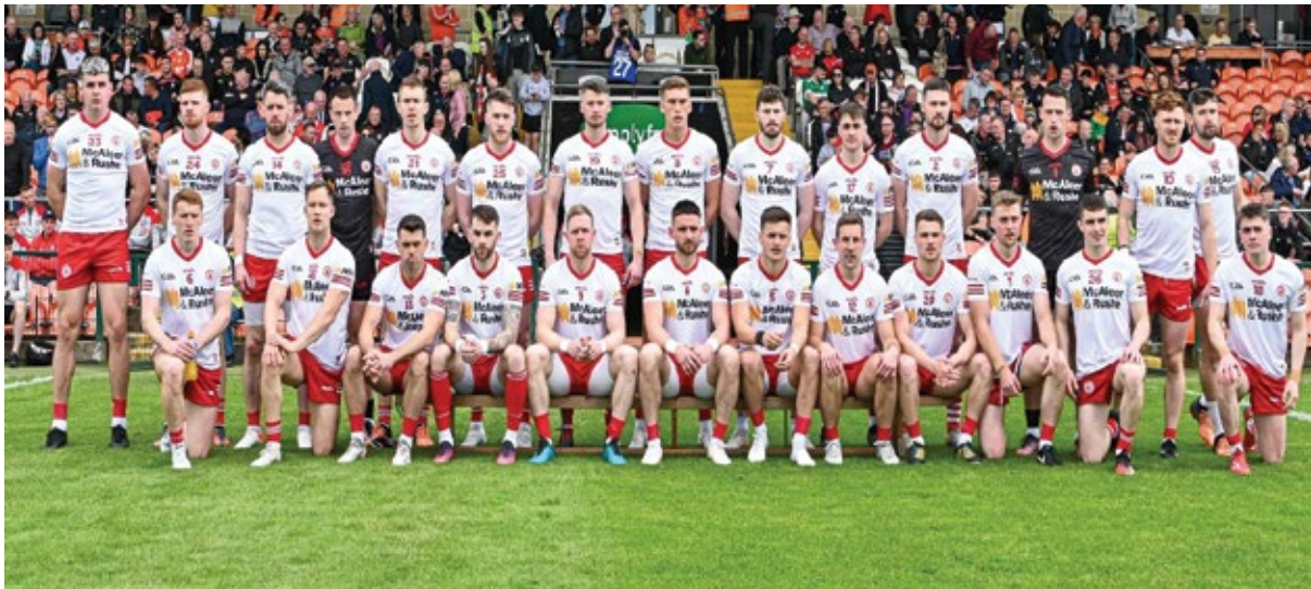
Tír Eoghain Senior Football Team (2022)