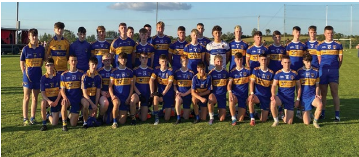
Tyrone Minor Football Champions 2022 – Donaghmore St Patrick's