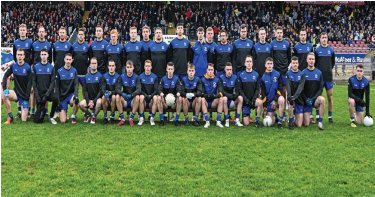
Tyrone Senior Football Champions 2022 - Errigal Ciaran