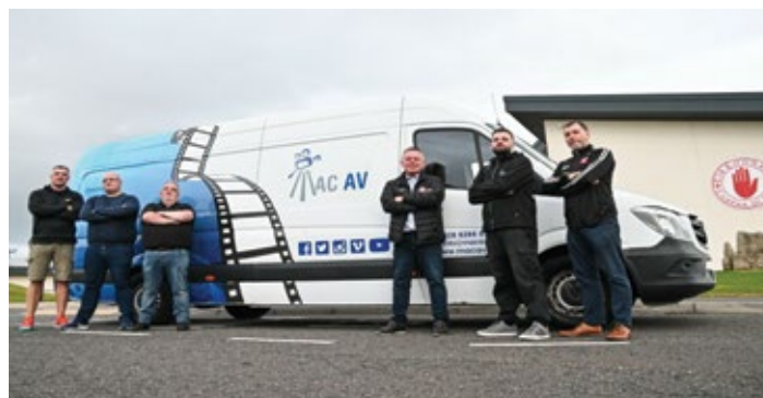
MAC AV & Tyrone GAA TV Commentary team members