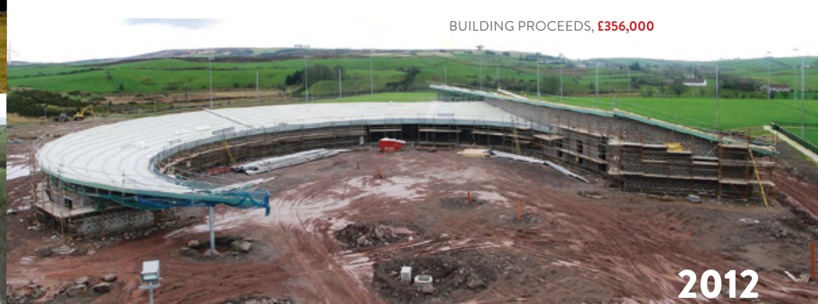
BUILDING PROCEEDS, £356,000

A SPECIAL PLACE WHERE GAELIC TYRONE CAN COME TOGETHER