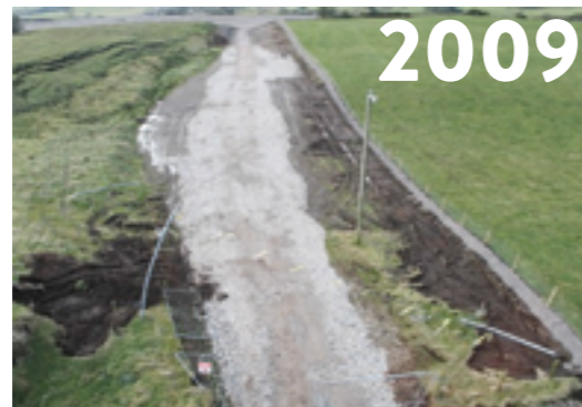
THE 'ROUGH FIELD' LEVELLED, £270,000