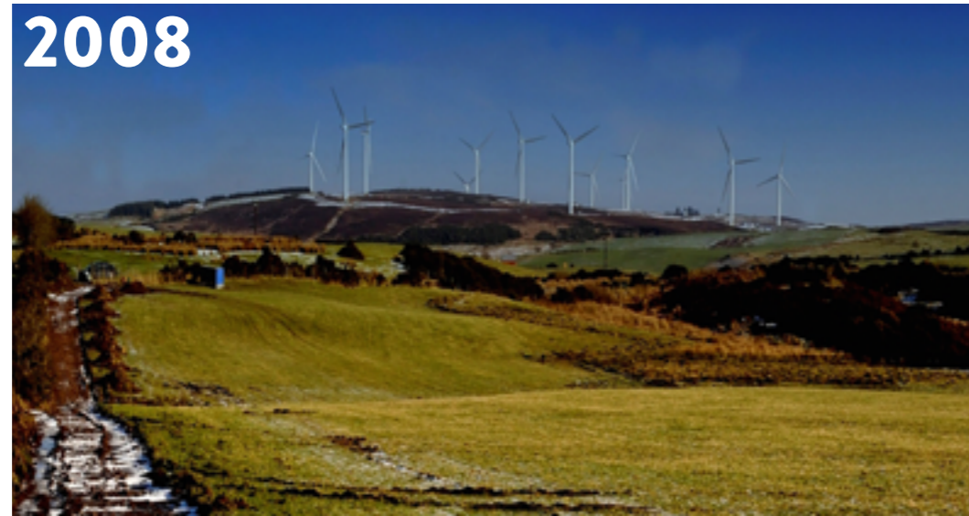
LAND BOUGHT, PLANNING OBTAINED, £190,000

YOUR ANNUAL CLUB TYRONE CONTRIBUTIONS ARE THE FIGURES IN RED