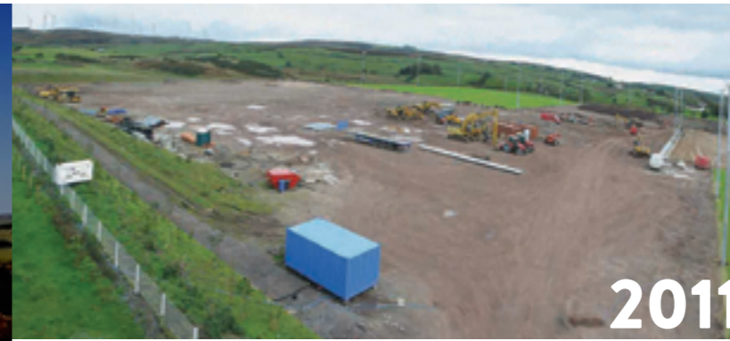
WORK STARTS ON THE BUILDING, £354,000