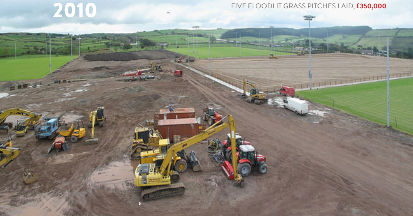
FIVE FLOODLIT GRASS PITCHES LAID, £350,000