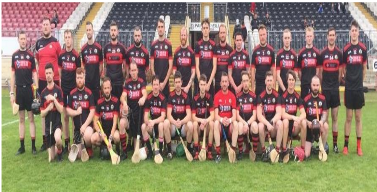
Tyrone Junior Hurling Champions (2020) – Naomh Colum Cille

Éire Óg Carrickmore, Eoghan Ruadh Dungannon, Naomh Colum Cille, Na Seamrogaí Strabane, Cú Chulainn an Ghleanna (Y), Uí Néill Tulach Óg (Y), Dúiche Néill an Bhinn Borb (Y).