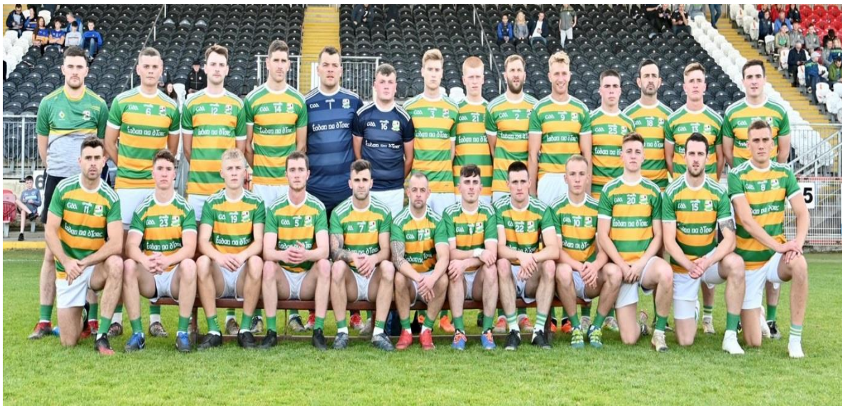
Tyrone Intermediate Football Champions (2020) – Edendork St Malachy's