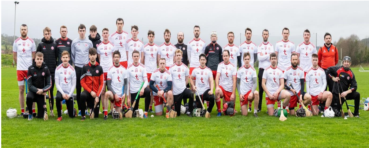
Tyrone Senior Hurling Team (2020)