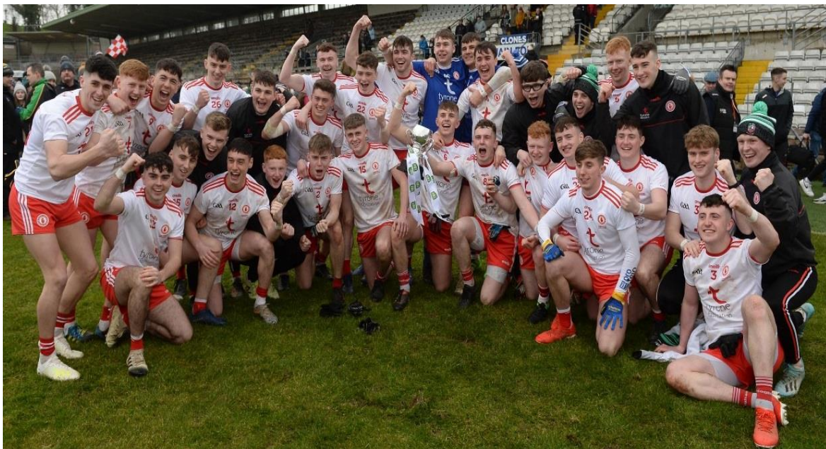
Ulster U20 Football Champions (2020)