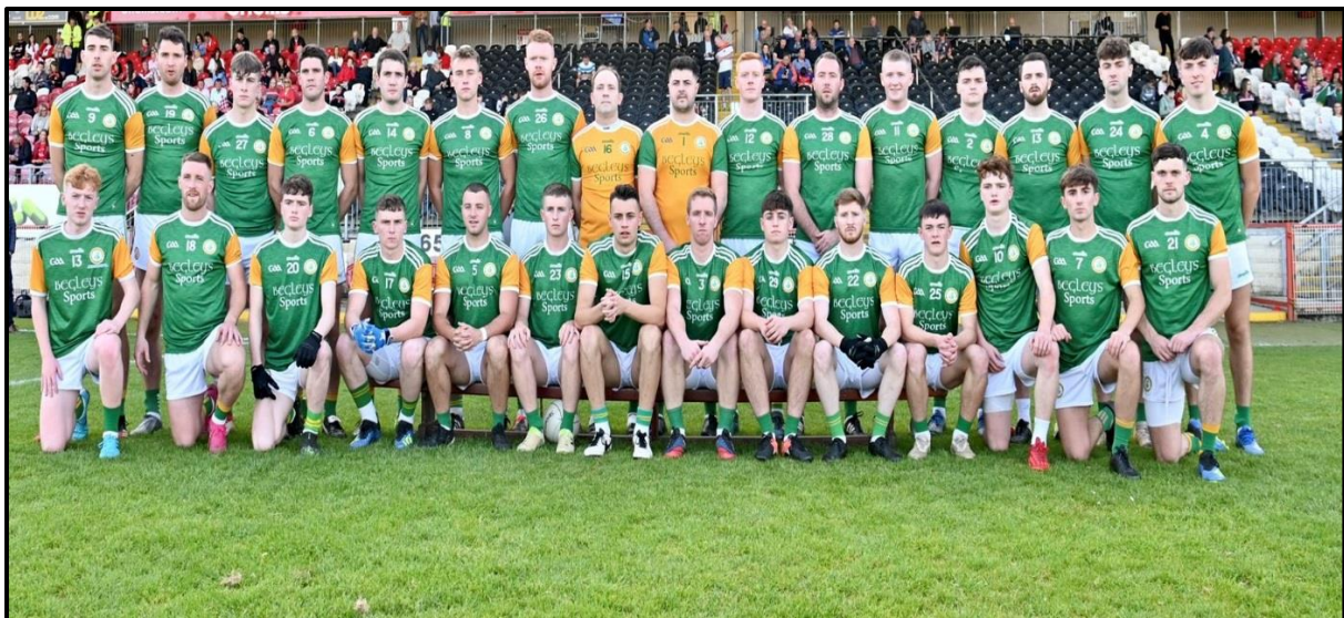
Tyrone Senior Football Champions (2020) – Dungannon Thomas Clarkes

In the Intermediate championship Gortin arrived in the final having displayed remarkable resilience in accounting for Owen Roe O'Neill's (after extra-time), Eglis (after extra-time and a penalty 'shoot-out') and Greencastle (again after extra-time); on the other side of the draw Edendork had reasonably comfortable victories against Clogher, Rock and Tattyreagh. In the final at Healy Park, on Saturday 19 th September, Edendork enjoyed an eight-point lead at the half-time interval and cruised to victory with the same winning margin. In collecting the Paddy Cullen Cup as Intermediate champions Edendork returned to the top division in Tyrone after their relegation in 2019.