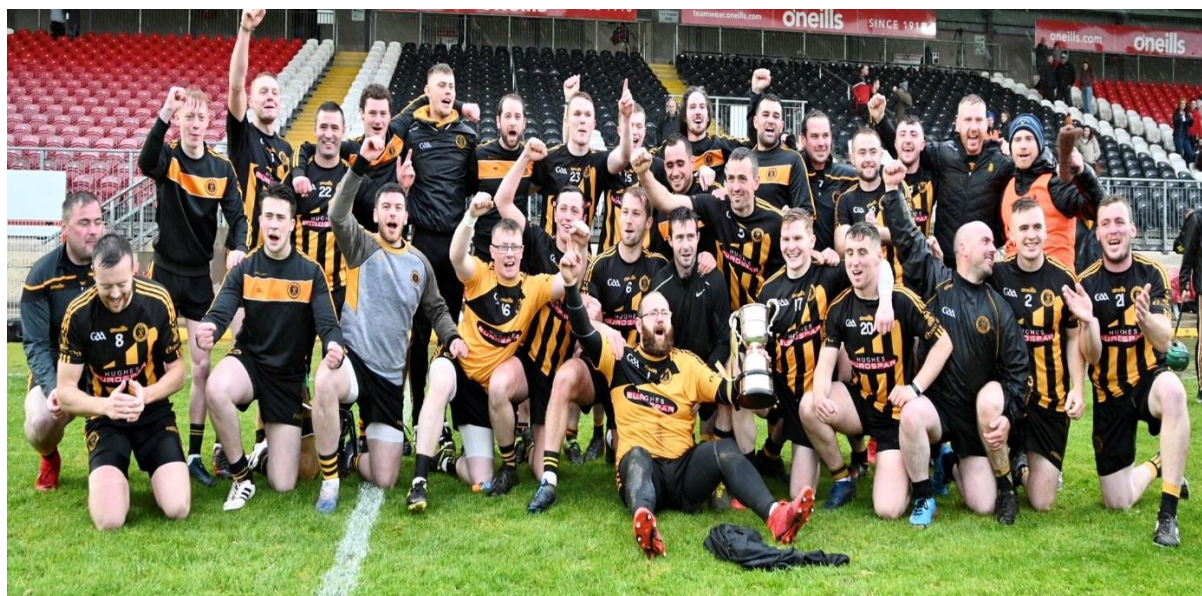
Tyrone Senior Hurling Champions (2020) – Carrickmore Éire Óg

Indeed, Trillick were undefeated in nine senior football championship games in the past two seasons, yet, because of penalty 'shoot-outs' the team was unable to progress in the Ulster Club championship in 2019 and was unable to retain its Tyrone senior crown this year.