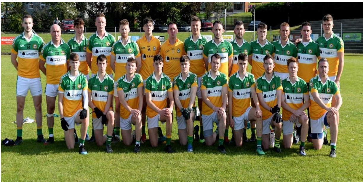
Tyrone Junior Football Champions (2020) - Kildress Wolfe Tones

As well, it could never have been imagined that all our Club championships could be streamed live to the county, the country, and all continents. Nor could it have been imagined that a senior football quarterfinal would be broadcast live by TG4, and that our two senior football semifinals would be broadcast nationally by RTÉ. Since Tyrone's Club players performed at such an exceptionally high standard in front of huge viewing audiences we might expect these broadcasters to come back in future years irrespective of any presence of Covid-19.