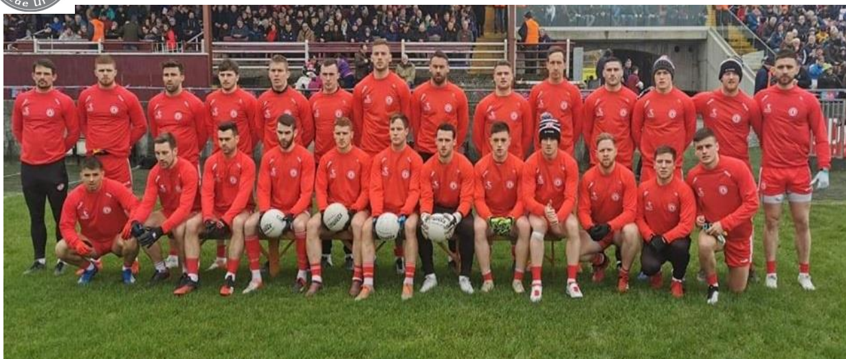
Tyrone Senior Football Team (NFL v Monaghan)