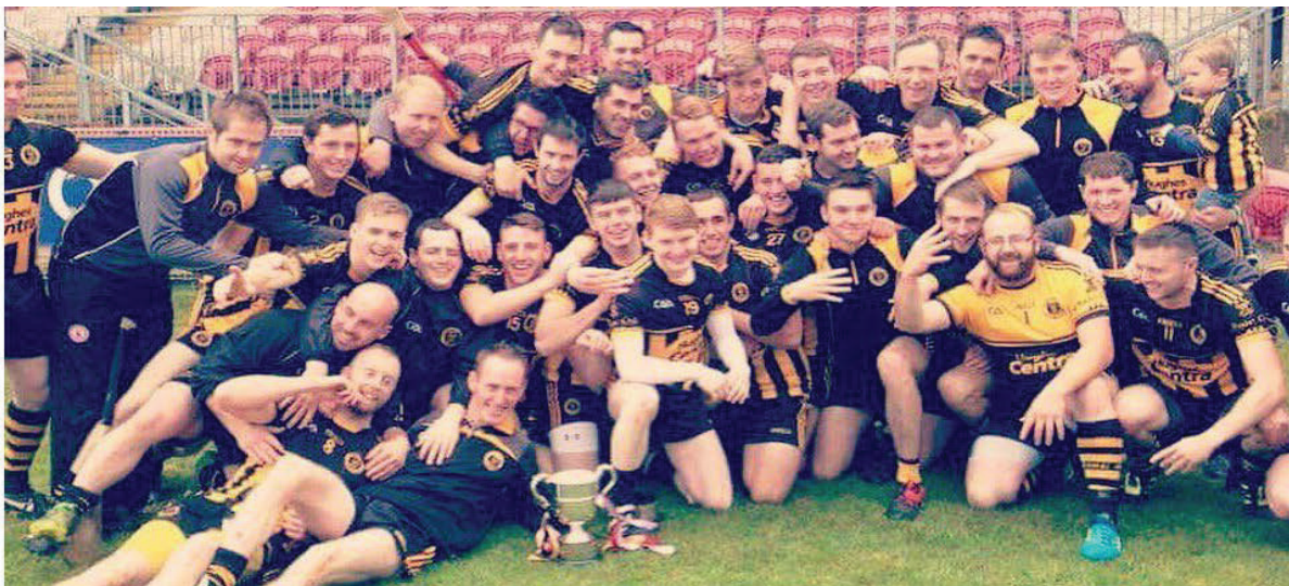
Éire Óg, an Charraig Mhór – Senior Hurling Champions 2017