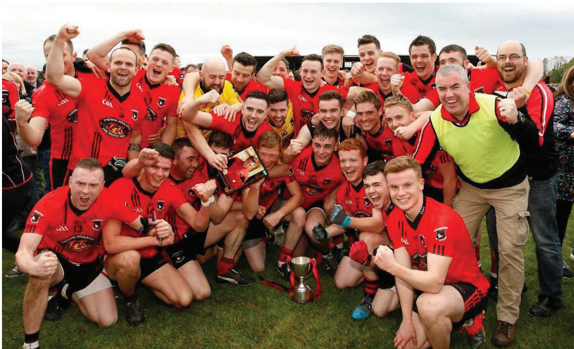
Naomh Pádraig, Taite Riabhach – Junior Football Champions 2017

Éire Óg Carrickmore, Eoghan Ruadh Dungannon, Naomh Colum Cille, Shamrocks Strabane, Cú Chulainn an Ghleanna (Y), Uí Néill Tulach Óg (Y), Dúiche Néill an Bhinn Borb(Y).