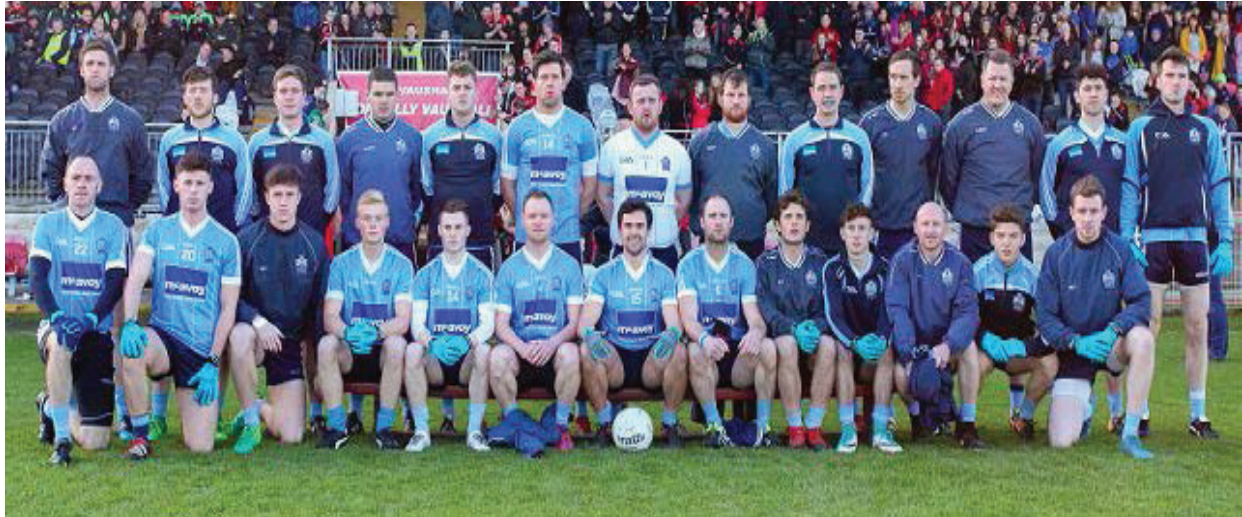
Tír na nÓg, an Mháigh – Tyrone & Ulster Intermediate Football Champions 2017