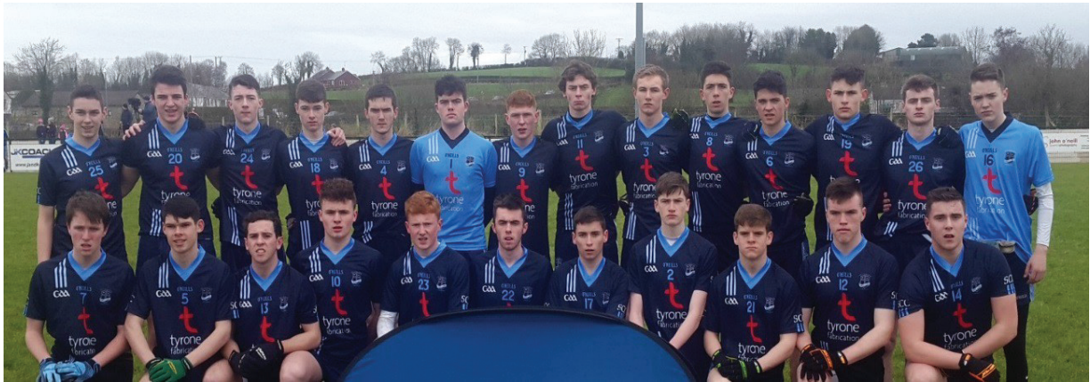
St Ciaran's High School, Ballygawley