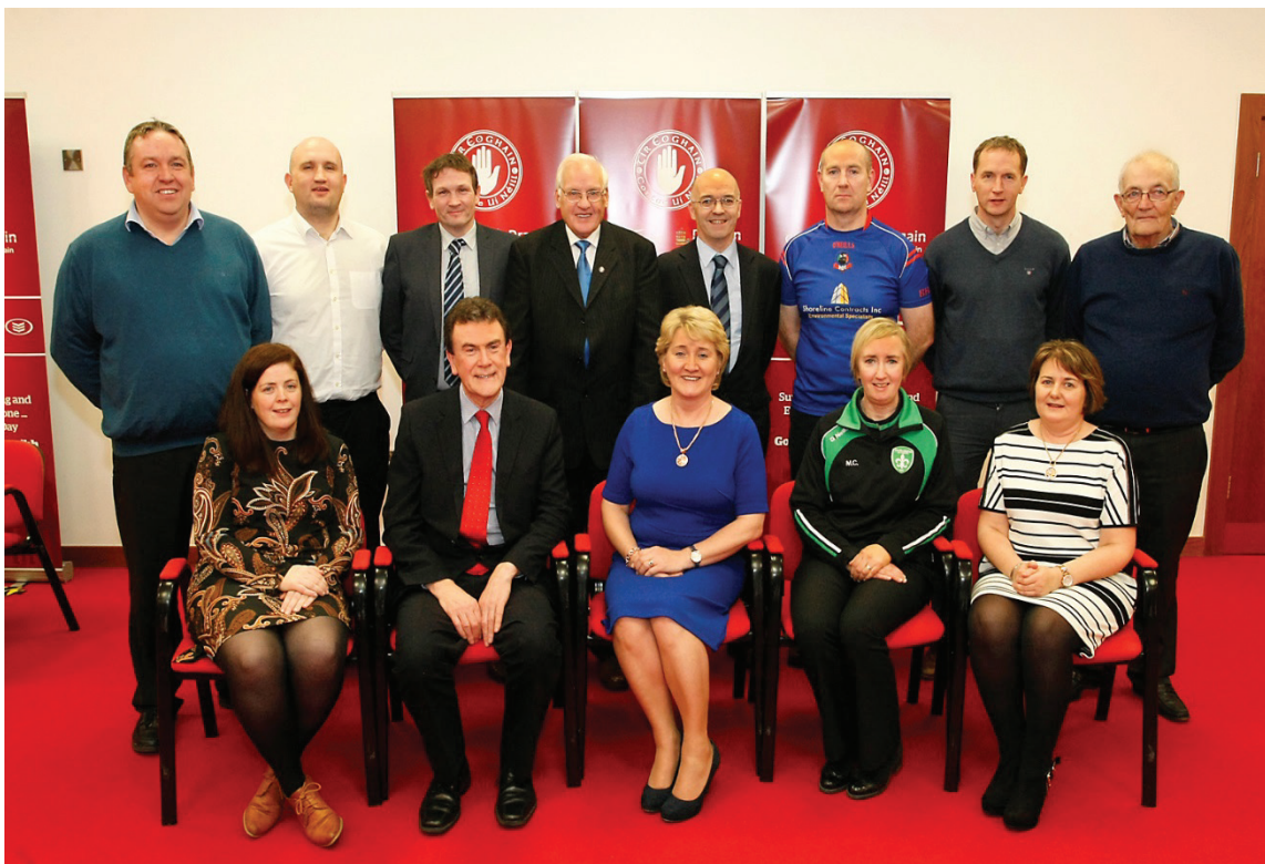
An Coiste Bainistí (2017)

Finally, Tyrone GAA was honoured to have its floodlit 3G facilities selected by the Michaela Foundation as the venue for establishing a Guinness World Record for the longest Gaelic football match; the record set on 7 th /8 th January 2017 was 24 hours 18 minutes and 51 seconds, and more than £70,000 was raised for the Foundation and Cancer Focus NI.