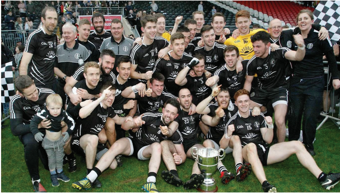
Naomh Éanna, an Ómaigh – Senior Football Champions 2017

In 2017 adult football commenced with league competitions on 9th April and the ordinary rounds concluded on 3 rd September. Relegation and promotion play-offs were deferred until the adult championships were finished. This remarkable achievement was attained as a result of two main factors, (i) the co-operation of all Clubs in adhering to the fixtures' plan presented at the beginning of the season which identified and included all starred games, and (ii) the serious thought given to, and the detailed work undertaken by the CCC in, the preparation of the County master fixture plan. It is fitting that we acknowledge this work of the CCC and applaud its officers for the delivery of such a successful league programme.