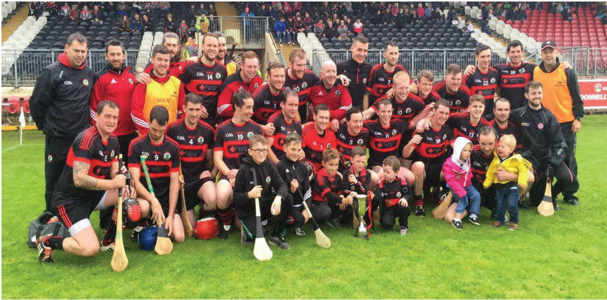
Naomh Coum Cille – Junior Hurling Champions 2017