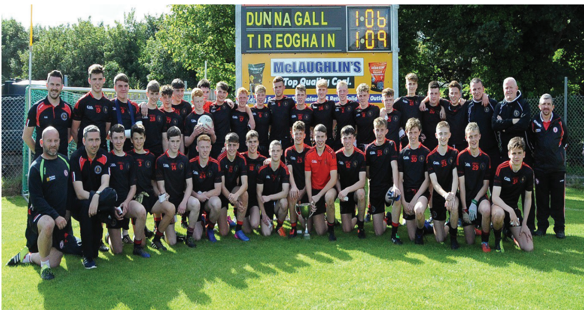
U16 Tyrone team – Buncrana Cup winners 2017