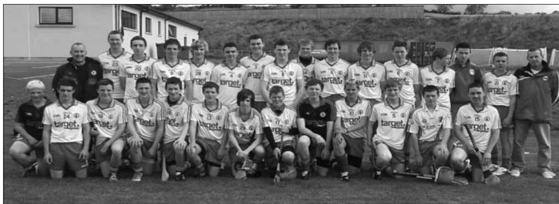
Tyrone U16 Hurling Team 2011