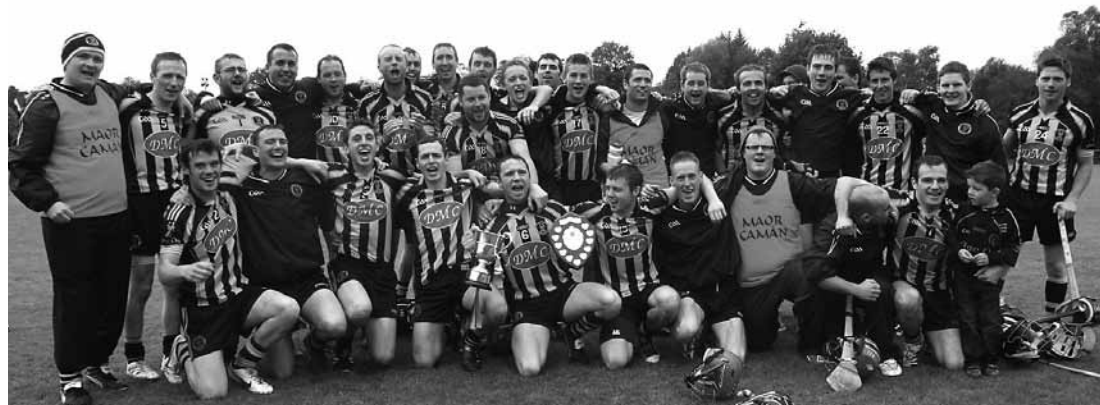
Éire Óg Carrickmore - Tyrone Senior Hurling Champions, 2011.