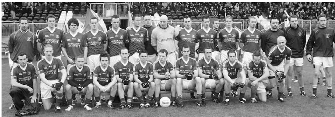
Dromore St Dymphna's - Tyrone Senior Football Champions & Division 1 League Winner, 2011