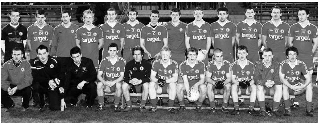
Tyrone Under-21 Football Team that reached the Ulster Championship Final in 2011.