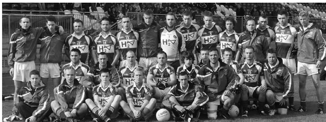
Derrytresk Fir an Chnoic - Tyrone Junior Football Champions, 2011.