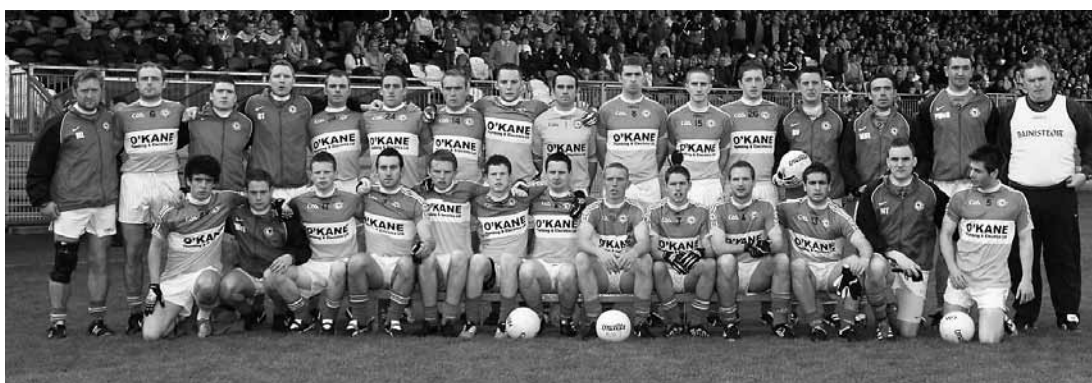
Kildress Wolfe Tones - Tyrone Intermediate Football Champions, 2011.