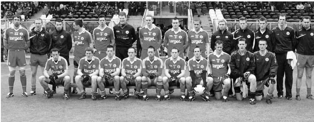
Tyrone Senior Football Team that reached the Ulster Championship Semi-Final in 2011.