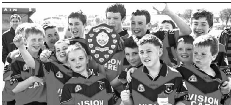
Feile Grade 2 Champions Tattyreagh St Patrick's