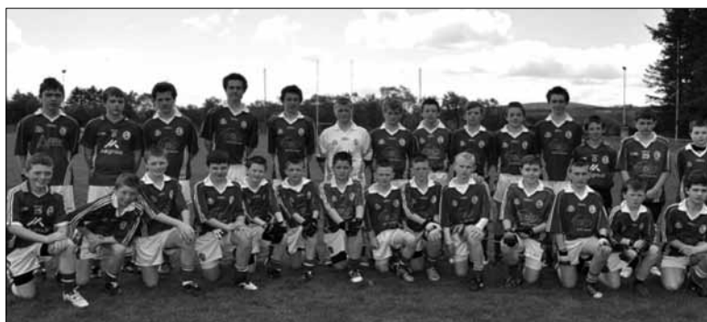
Feile U14 Champions Galbally Pearse's