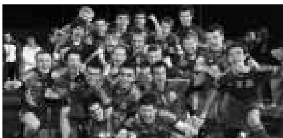
Naomh Mhuire - Grade 1 League & Chamionship Winner 2011

It is anticipated that an ongoing and overdue review of the allocations of All-Ireland Finals' tickets to counties and other units, being undertaken at national level, will soon be concluded; it is expected that it will be recommended - quite appropriately - that participating counties should be provided with greater allocations than are presently made available. Counties' registered membership will also be taken into account and the level of participation by a county in each code could be used as a further criterion in determining the number of tickets allocated to the respective Final.