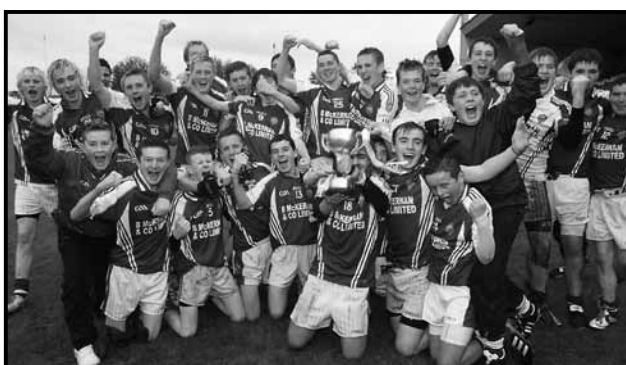
Na Fianna Coalisland Tyrone Juvenile Football Champions, 2011.