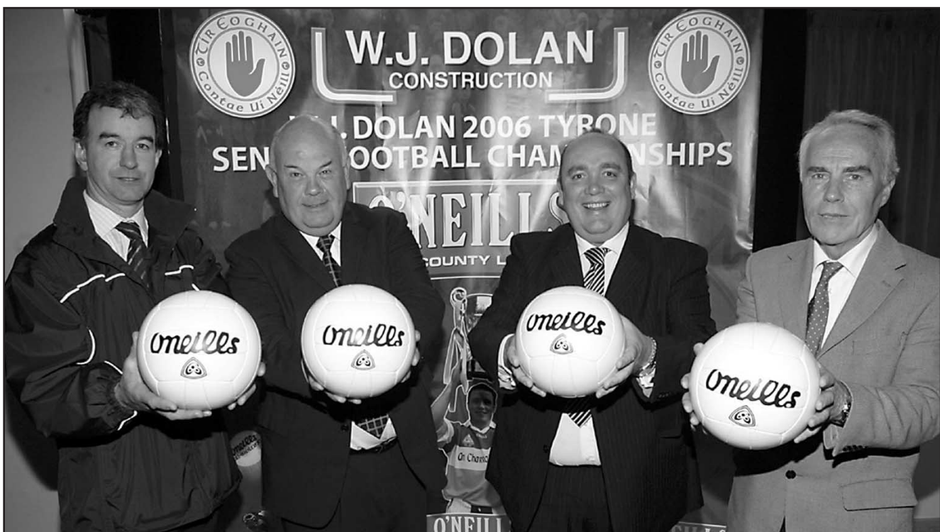
At the launch of the WJ Dolan Football Championships and O'Neill's All-County Football Leagues