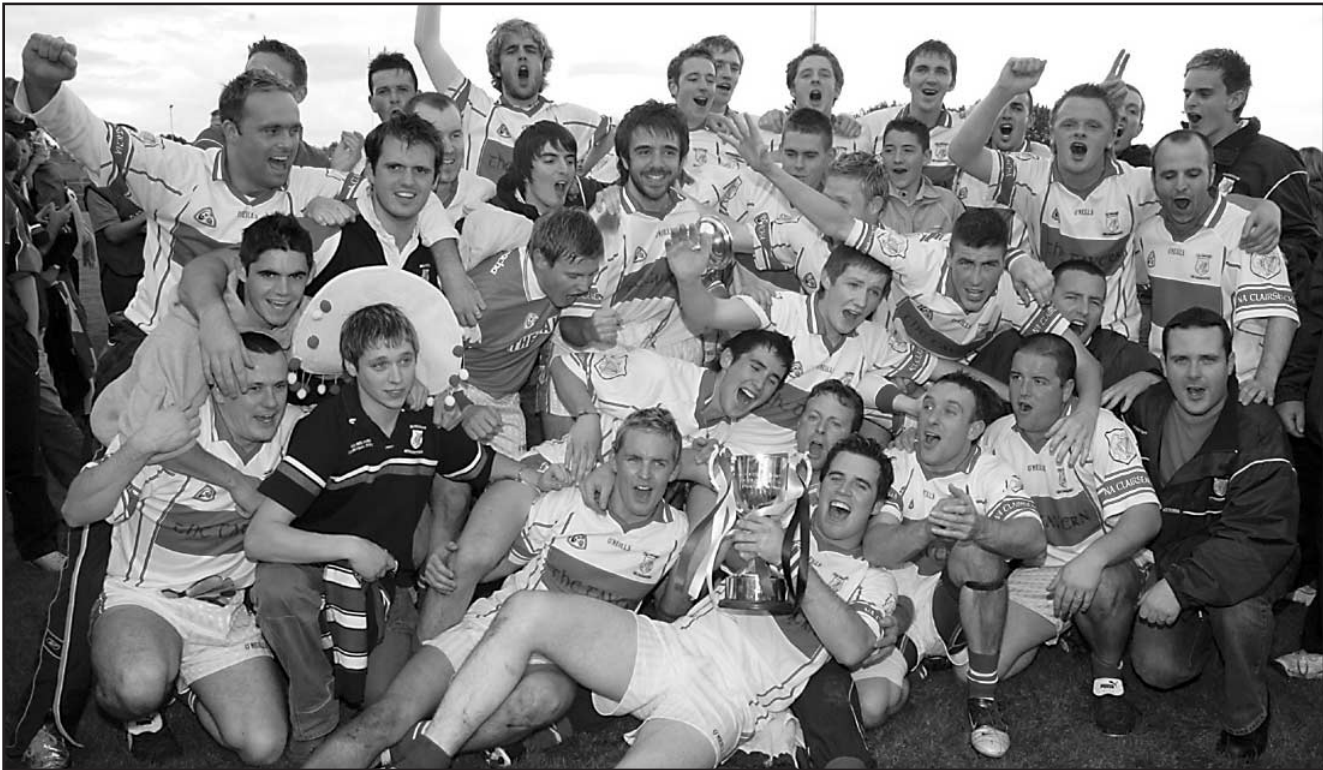
Intermediate Championship Winners, Stewartstown

Finally I would like to take this opportunity to thank all clubs who willingly gave of their facilities as and when requested throughout the year and for the support and assistance which they provide. Your support is greatly appreciated and valued!