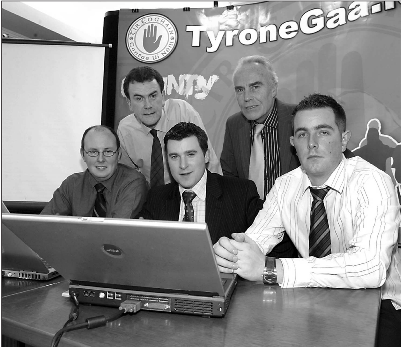
Launch of the Tyrone GAA Website