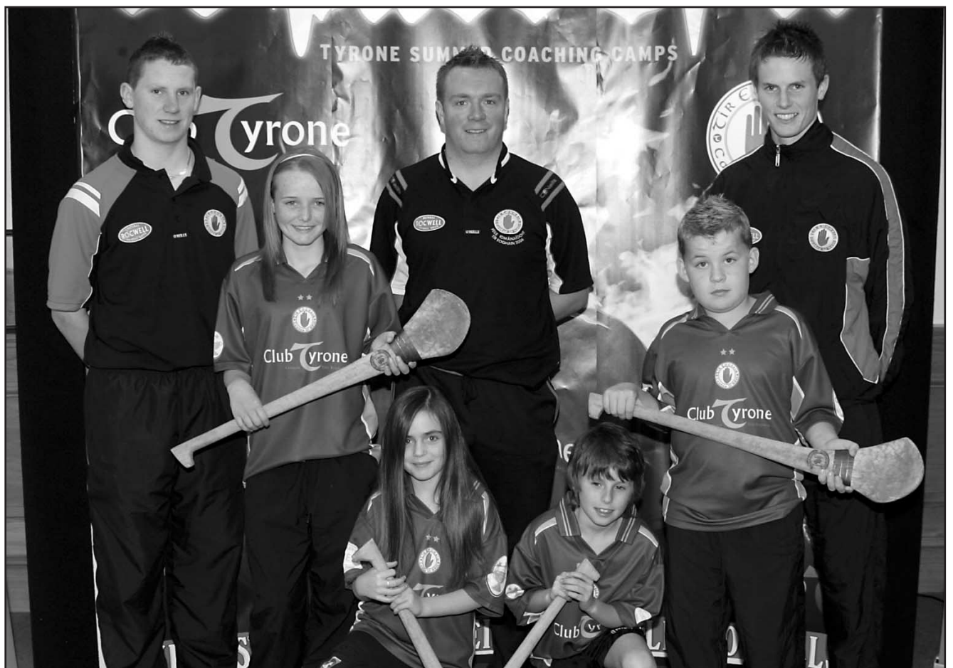
Pictured at the launch of the Tyrone Hurling Summer Camp Launch 2006

In the Ulster Club championships, the Tyrone representatives all made good progress in their opening fixtures, with Greencastle having a comfortable victory against Ardoyne (Antrim) before facing the challenge of Drumhowan. In their preliminary round, Stewartstown defeated St Brigid's (Antrim) following a replay, then eliminating Monaghan's champions Carrickmacross to earn a semifinal date against Armagh's Ballymacnab. At Omagh, Errigal Ciaran had a single-point victory against Enniskillen to reach the semifinal stage against Derry champions Ballinderry. At time of printing these competitions were ongoing.