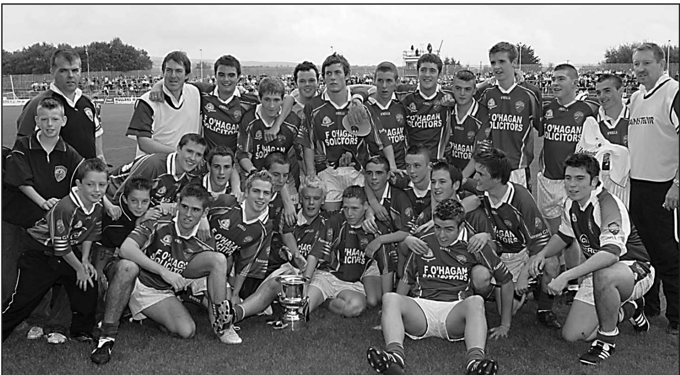
Minor Championship Winners, Coalisland

One of the major decisions of the year and indeed recent years has been the decision by clubs to revert to a 3 x 16 league system to be implemented in 2008 which I personally warmly welcome.