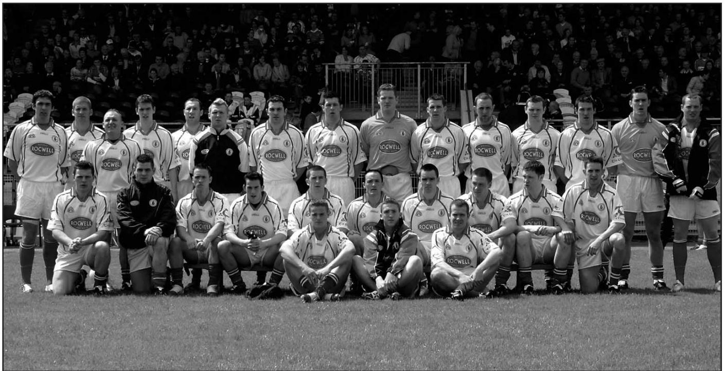
Tyrone Senior Team 2006