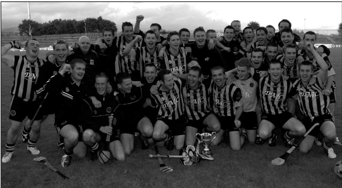
Senior Hurling Championship Winners, Éire Óg Carrickmore