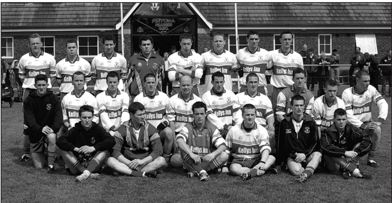
Senior Championship Winners, Errigal Ciaran

Beragh, Brockagh, Castlederg, Clogher, Derrytresk, Dregish, E.R.Uí Néill, Glenelly, Greencastle, Newtownstewart, Tattyreagh, Rock.