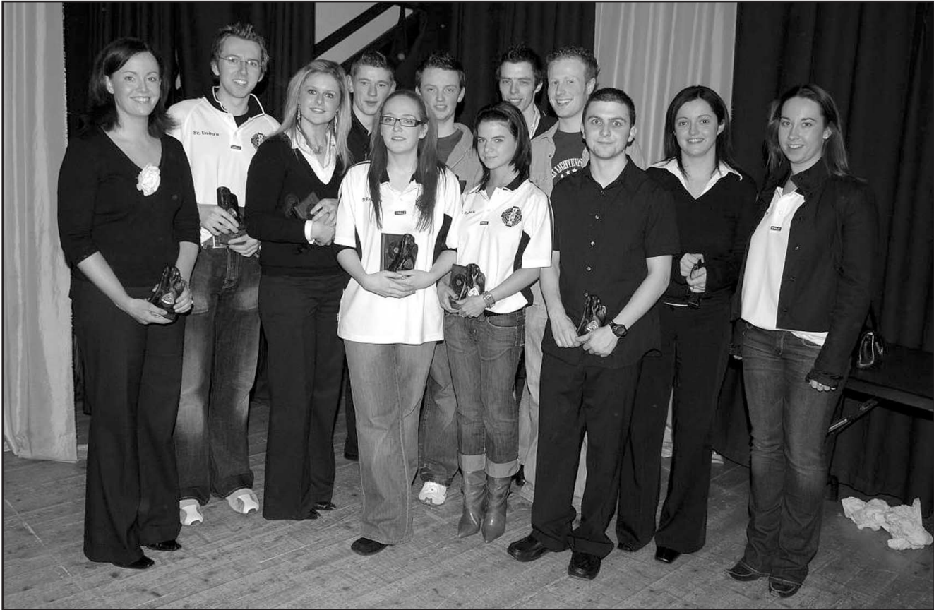
The Omagh winners at the Tyrone final