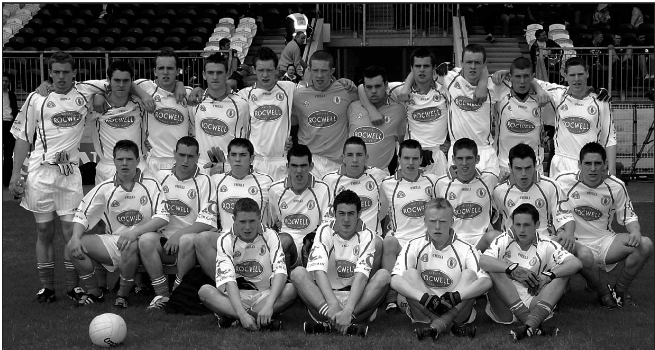
Tyrone Minor Football Team 2006

With the provincial championship concluded, all attention turned to the All-Ireland Qualifier series where first opponents were Louth. Here, Tír Eoghain had an outstanding first half, then allowed the opposition to take control and eventually had to fight back to draw the game. The sides remained level at the end of extra time and so the championship moved from Navan back to Healy Park. On their second chance, the home side emerged victorious by a margin of five points.