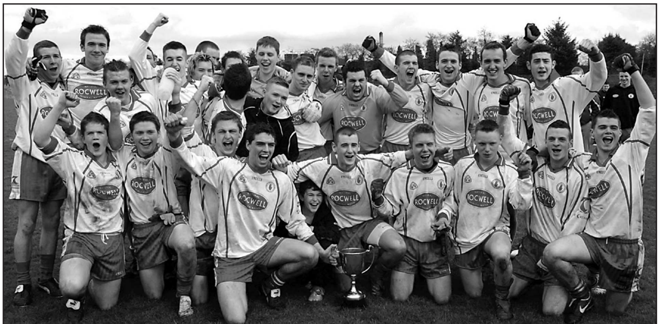
Ulster Vocational Schools Football Champions 2006

Another year of widespread activity and many significant successes that are considered further in the remainder of this report.