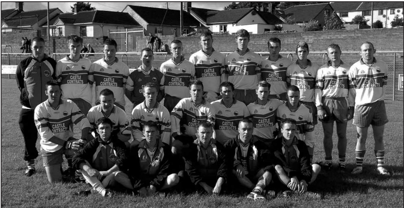
Junior Championship Winners, Greencastle

Development squads are also on the agenda for the forthcoming year, first of all identifying those suitable then following this up with the introduction of a squad with the relevant training and games that will benefit the county in the coming years.