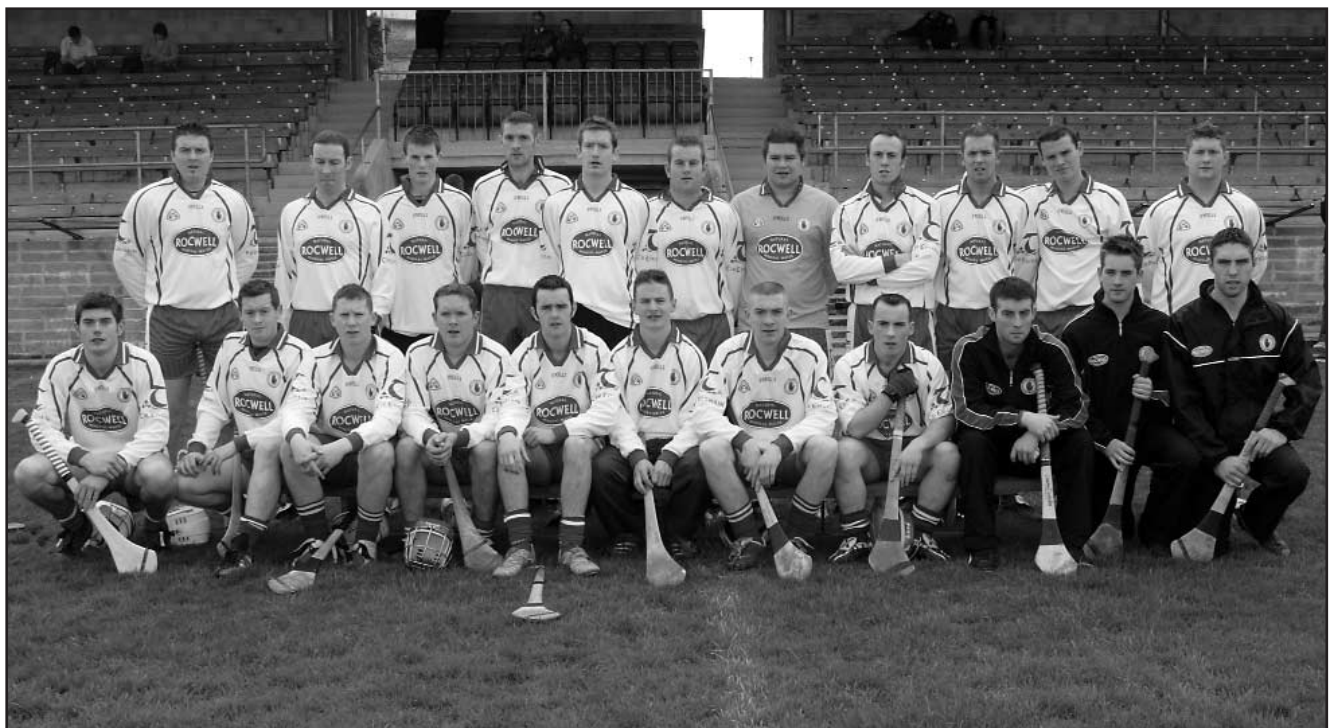
Tyrone Senior Hurling Team 2006