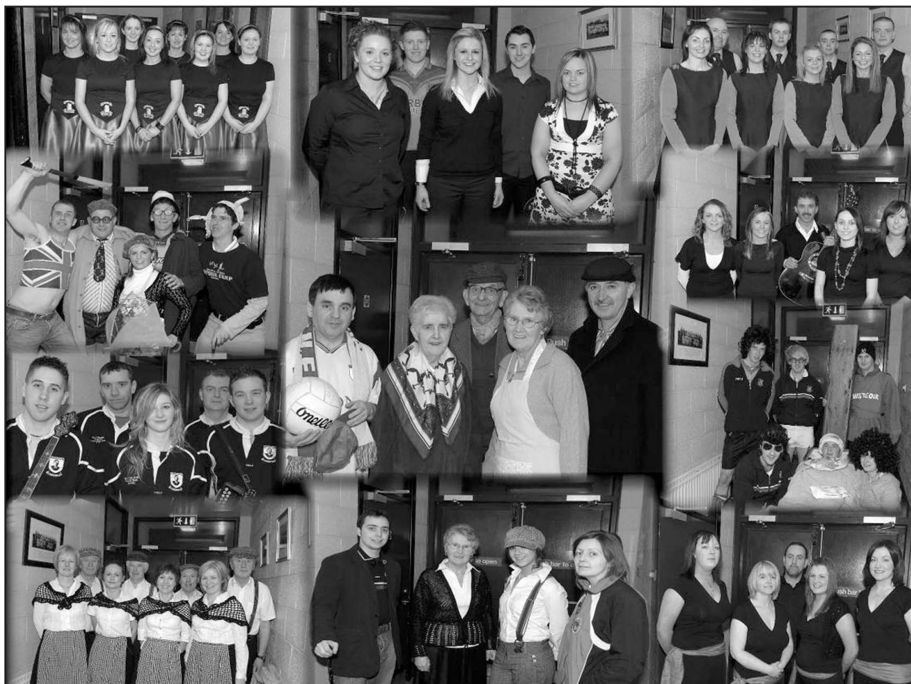
A selection of Clubs which took part in senior Scór in 2006