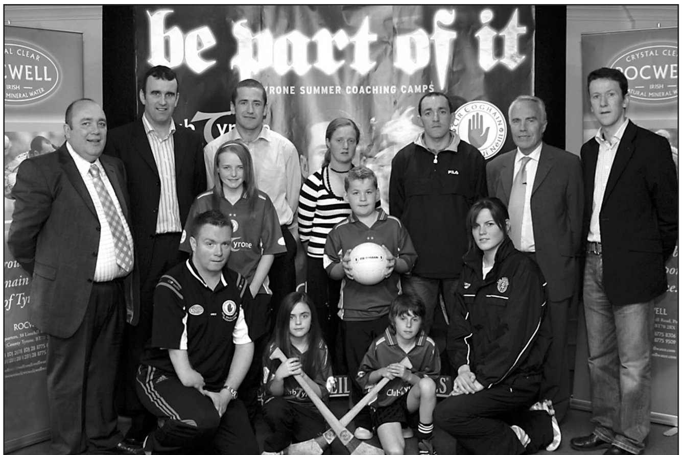
Launch of the Club Tyrone Summer Camps 2006

Tá súil againn go mbeibh Nollaig shona agaibh go léir agus AthBhliain shona freisin. Mar a dúirt an file cáiliúil 'ar aghaidh go deo a chairde leis an Cumann Lúthchleas Gael'.