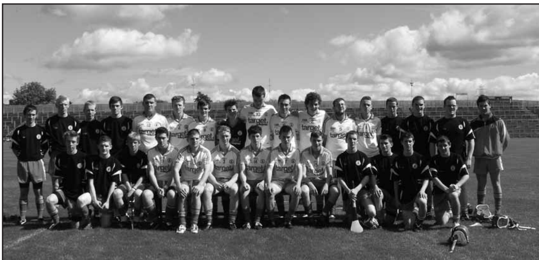
All-Ireland 'C' Minor Champions 2010