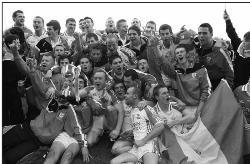
County Intermediate Football Champions 2010 – Cumann Caoimhín de Barra Doire Locháin