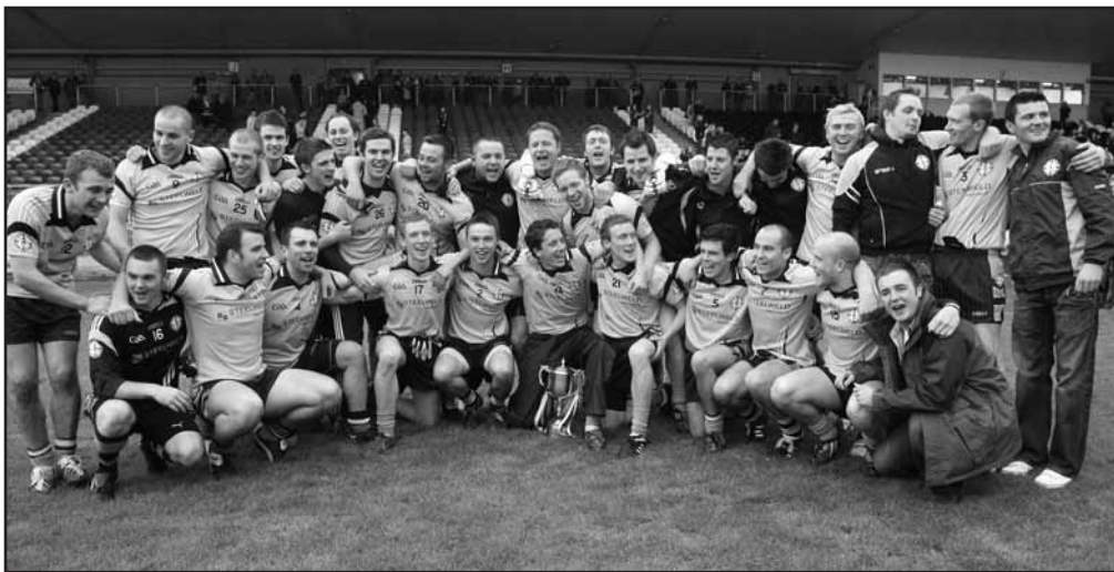
Cookstown Fr Rocks – All-Ireland Intermediate Champions 2010

The Omagh St Enda's minor footballers did not rest on their laurels either, after winning the 2009 county championship; they strolled through the provincial championship to a final against Down champions, Kilcoo, and after a titanic struggle emerged as Ulster title holders with a one-point winning margin. Final scoreline: Omagh St Endas 0-12 Kilcoo 0-11