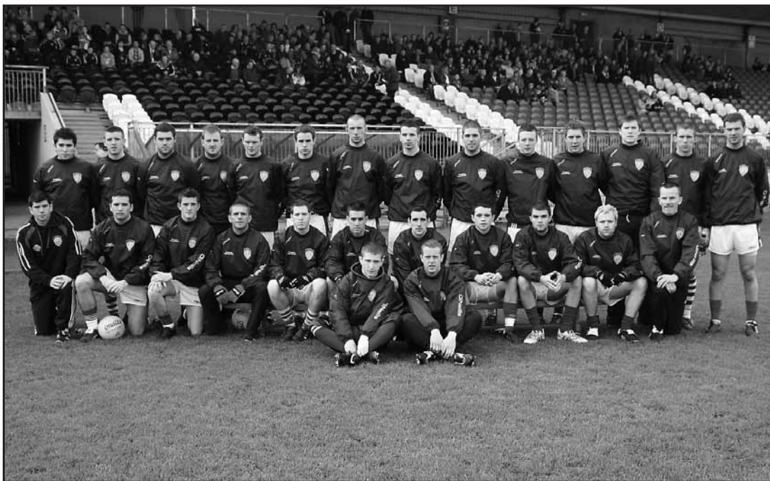
Na Fianna Coalisland - Tyrone senior football champions 2010

In the Ulster championships there were mixed fortunes for the winners from Tír Eoghain but unfortunately there were no titles won in 2010. Cill na mBán lost to the Monaghan junior champions, Corduff, after a replay; likewise Doire Locháin fell heavily to Doohamlet from Monaghan in the semifinal, after overcoming Cavan opposition (Drumalee) in the opening round. And senior champions, Oileán a'Ghuail also suffered defeat by a single point at the semifinal stage in Enniskillen against Naomh Conal of Donegal, following a tough encounter with Roslea in the quarterfinal.