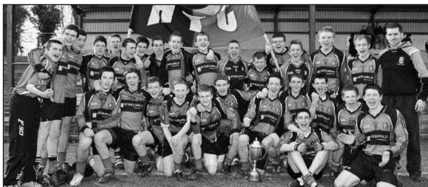
Cookstown Holy Trinity High School – All-Ireland U16 Champions 2010