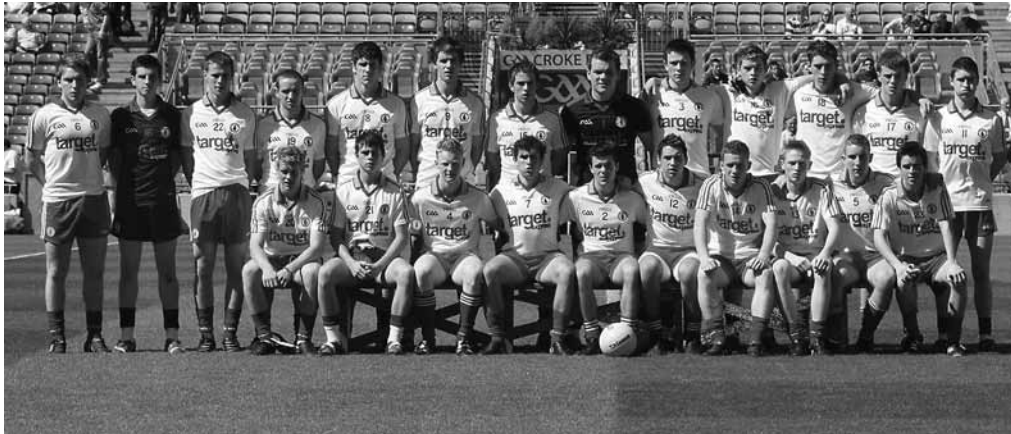
Ulster and All-Ireland Minor Football Champions 2010