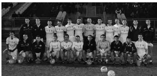
Tyrone U21 Football Team 2010