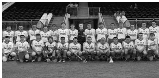
Tyrone U21 Hurling Team 2010