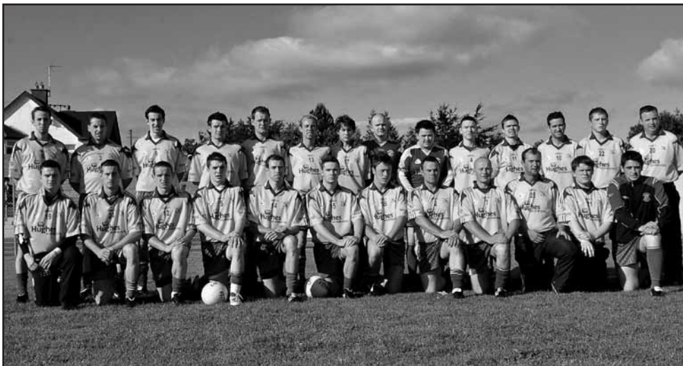
Tyrone Junior Football Champions 2010 - Naomh Mhuire Cill na mBan