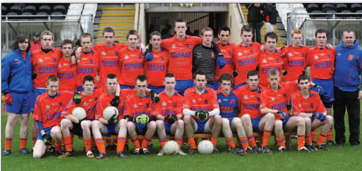
Ardboe O'Donovan Rossa's - Tyrone Minor Champions 2008

At County level the main concentration of developmental work during the past three years was at Healy Park Omagh and we can all be proud of the facilities now available to the county at the St Enda's Club. Now, in order to ensure that the fullest use may be made of the excellent floodlighting and spectator facilities, it will be necessary to undertake a major replacement of the playing surface; this has been a cause of concern to the Club Committee over a number of years and was particularly highlighted during the wet summer of 2008. It is anticipated that the appropriate work on the playing surface can commence in the immediate future when the necessary funding has been secured in place.