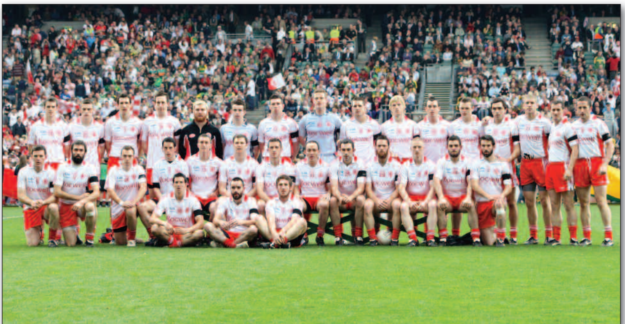
Tyrone Senior Team - All-Ireland Champions 2008