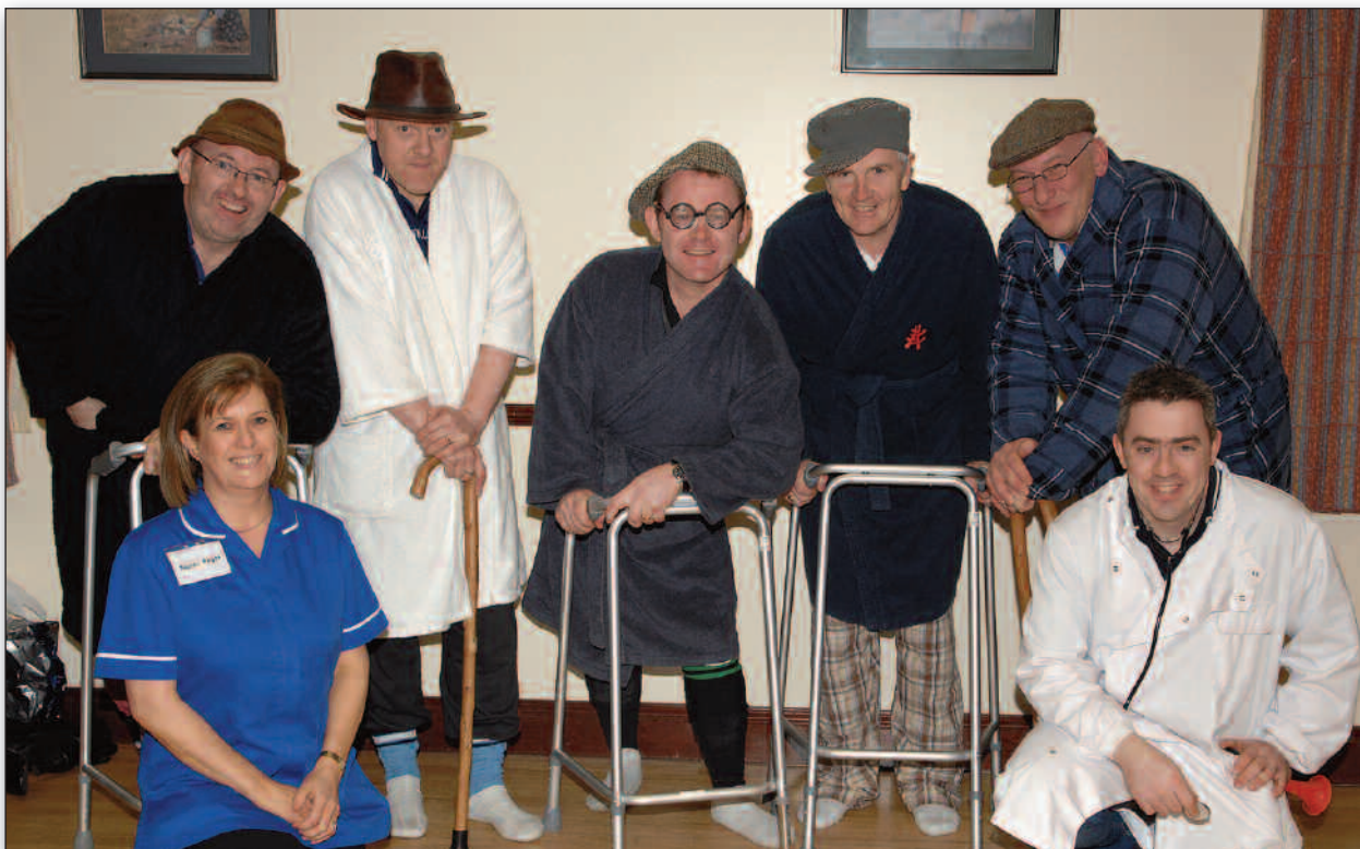
All-Ireland Champions, Nuachleas: Killyclogher St Mary's

The culture and language sub-committee has now taken on this new and enlarged programme during the course of the past year within Cumann Luth-Chleas Gael in Tyrone. It is no longer a committee which is operational only in the closed season but practically all the year round, right from the beginning of January until the week before Christmas.