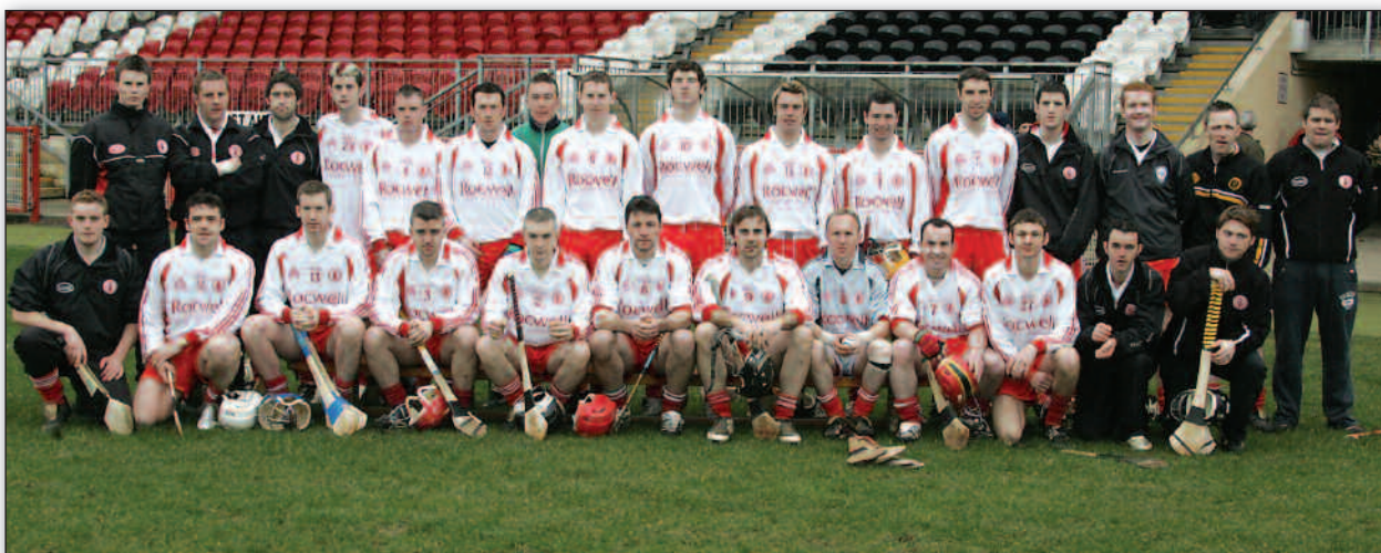
Tyrone Senior Hurling Team 2008