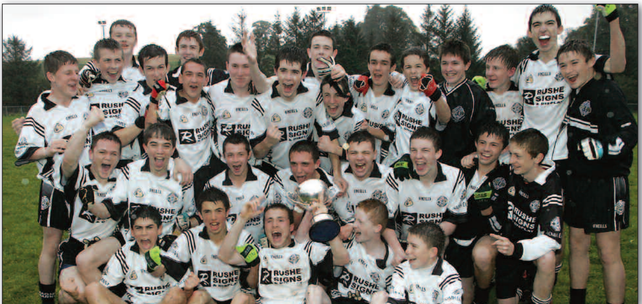
Omagh ST. Enda's - Tyrone Under 16 Champions 2008

The Youth Committee and CCC introduced some changes to the U-13 FL for 2008 on a trial basis. The aim of these changes was to build on the success of Go Games in recent seasons and to help young players bridge the gap between Go Games football rules at U-10 & U-12 and 'full rules'. The main change was the implementation of the 'Two Touch' Rule. The coaching aim, of this modified possession rule, is to promote better team-play and decision-making rather than a few players dominating possession. Feedback from clubs and coaches on this trial has been very positive and serious consideration must be given to introducing this two touch rule at U-14 level in 2009. It is vital that we continue to review and improve on our youth structures if Tyrone is to remain as a top football county in the future.