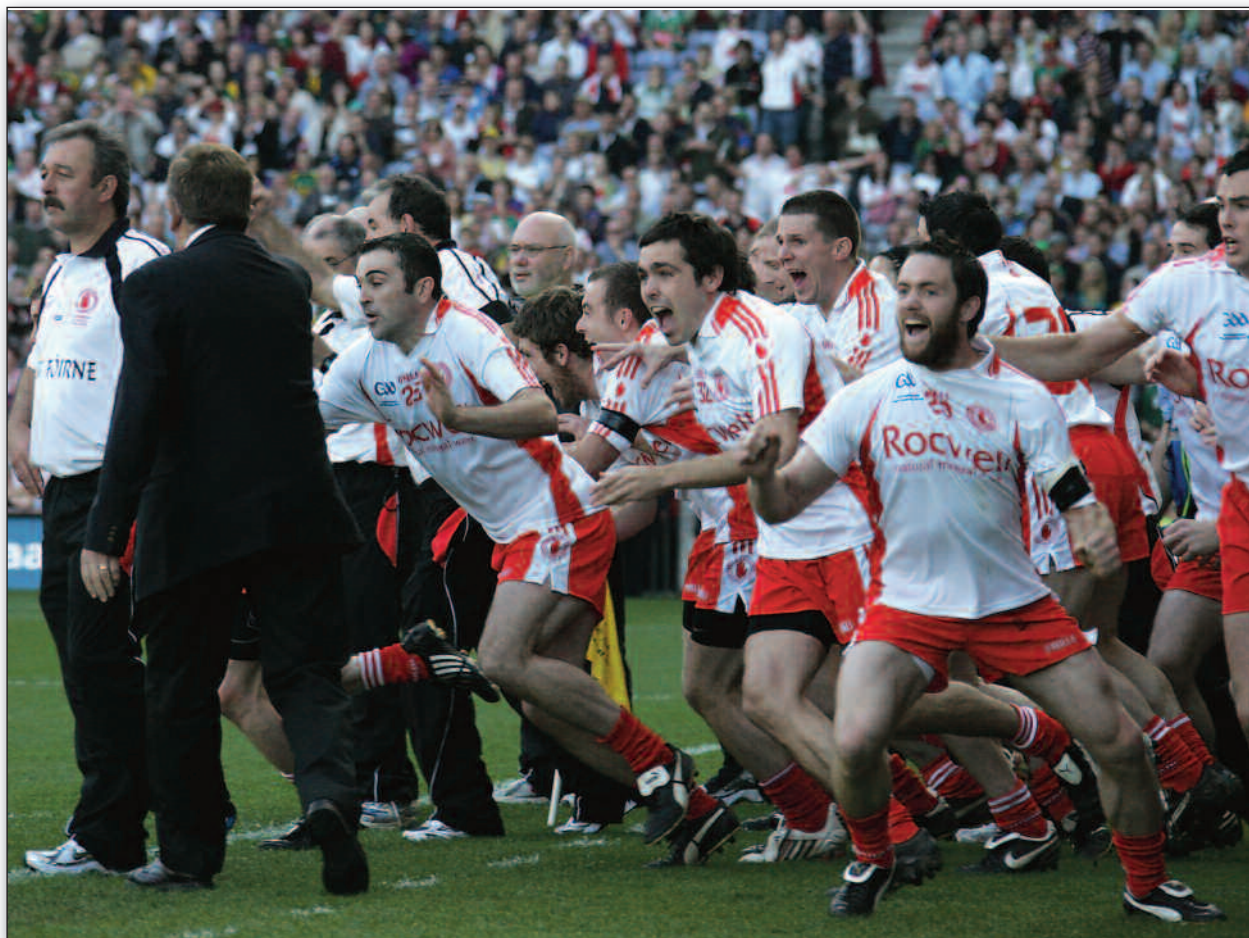
Tyrone players celebrate at the final whistle of the 2008 All-Ireland senior final

Aghaloo, Augher, Beragh, Brackville, Brockagh, Castlederg, Clogher, Derrytresk, Dregish, Drumquin, Drumragh, Errigal Ciaran III, E.R.Uí Néill, Fintona, Glenelly, Newtownstewart, Strabane.