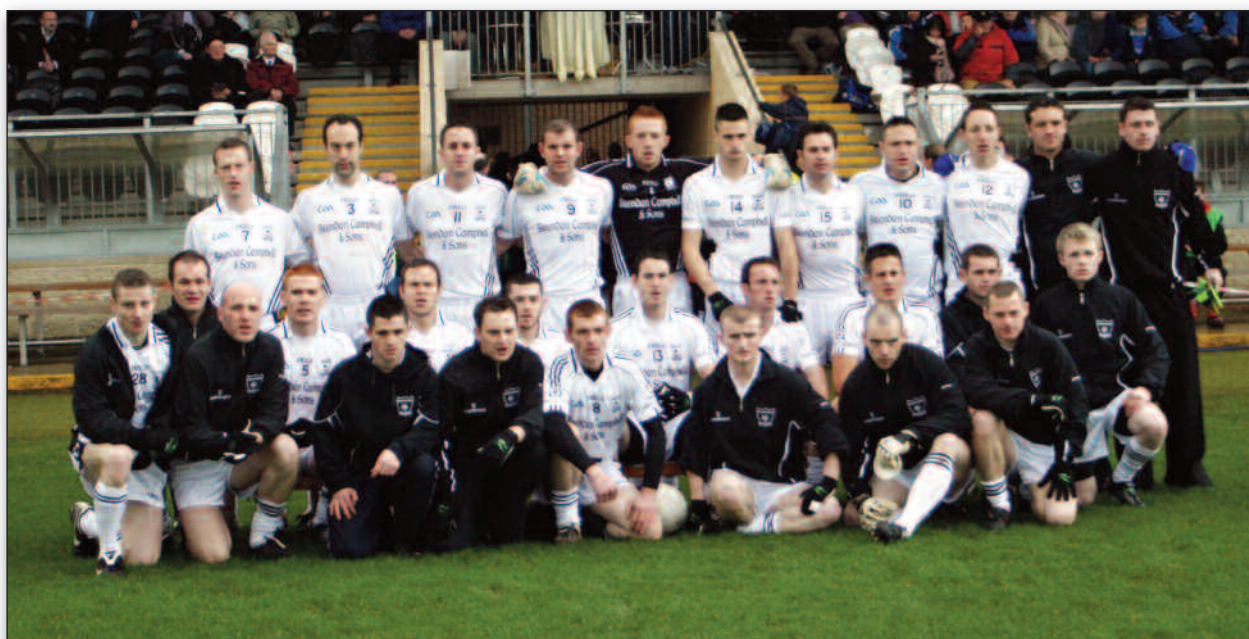
Clonoe O'Rahilly's - Tyrone Senior Champions 2008