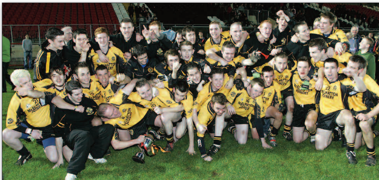
Augher St. Macartan's - Tyrone Junior Champions 2008

The 1983 senior championship-winning Trillick St Macartans' were also present on County Finals' day, with team members being introduced and presented with a special commemorative medal by the County Chairman.