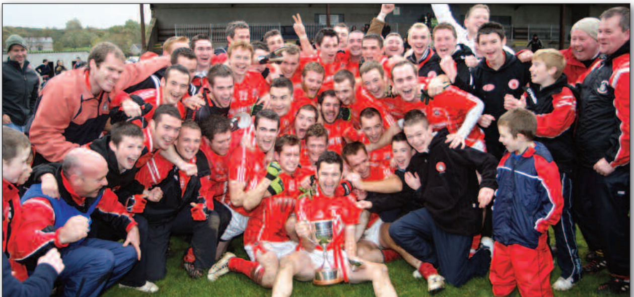
Trillick St. Macartan's - Tyrone Intermediate Champions 2008

The curtain-raiser in Healy Park was the County Minor final, sponsored by Teamtalk, featured the St Enda's Club Omagh against Ardboe's O'Donovan Rossa. Like the senior game, this match also ended up in a draw; there was no extra-time here and in the replay at Galbally the following Saturday, Ardboe fought back strongly to win the final by a single point.