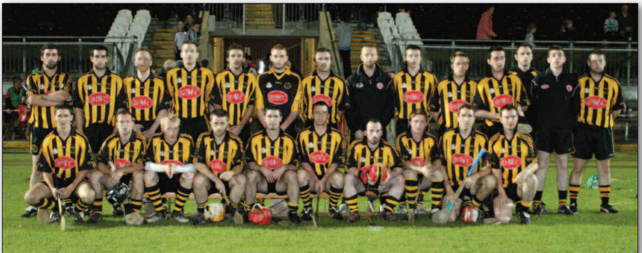
Éire Óg - Tyrone Senior Hurling Champions 2008

The semifinal between Carrickmore and Gort na Mona (Antrim) became a rather protracted affair; at the end of the game, both Clubs and the referee indicated that the game was drawn, but as a result of the match video being examined by the referee he decided that Gort na Mona won by two points. This led to an objection to Ulster Council and then an appeal to the Central Appeals Committee at Croke Park. It decided that the original decision of the referee should stand and the match was immediately refixed; this time the Antrim champions secured their victory winning on a scoreline of 1-14 to 1-10.